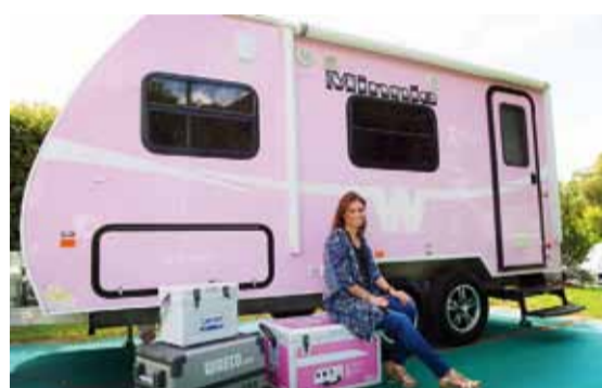
The Pink Minnie caravan

THE competition that makes dreams come true for three adventurous Australian couples or families is back, with Dometic announcing the 2016 Follow The Sun competition.