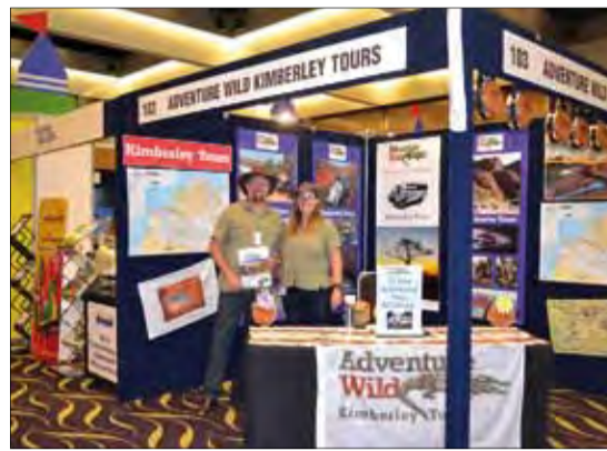
Perth Holiday & Travel Expo - one-stop-shop

IS it that people are working harder and stretching themselves too thin that they need to get away and recharge the batteries more often, or are they becoming more adventurous, and seeking out unique travel options to make the most of the wonderful world we live in?