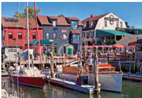
Newport Rhode Island