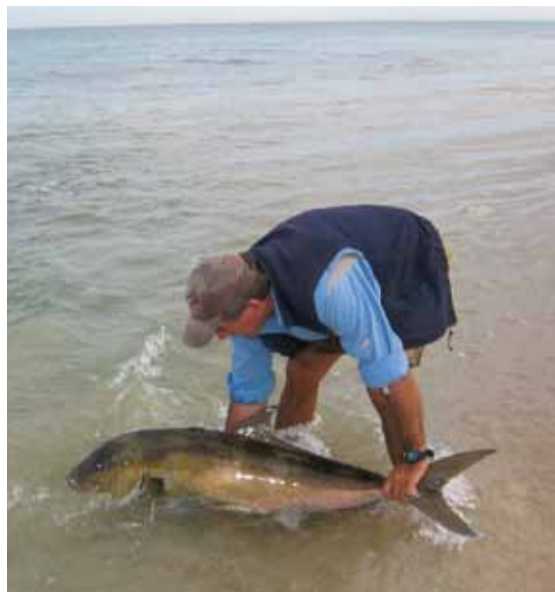
Keeping or releasing fish is largely a matter of commonsense