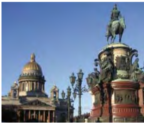
Saint Isaac's Cathedral, St Petersburg, Russia

For further information (and bookings for this event) refer to museum.victoria.com.au/planetarium/