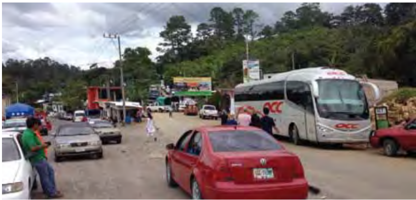
A typical road in Mexico