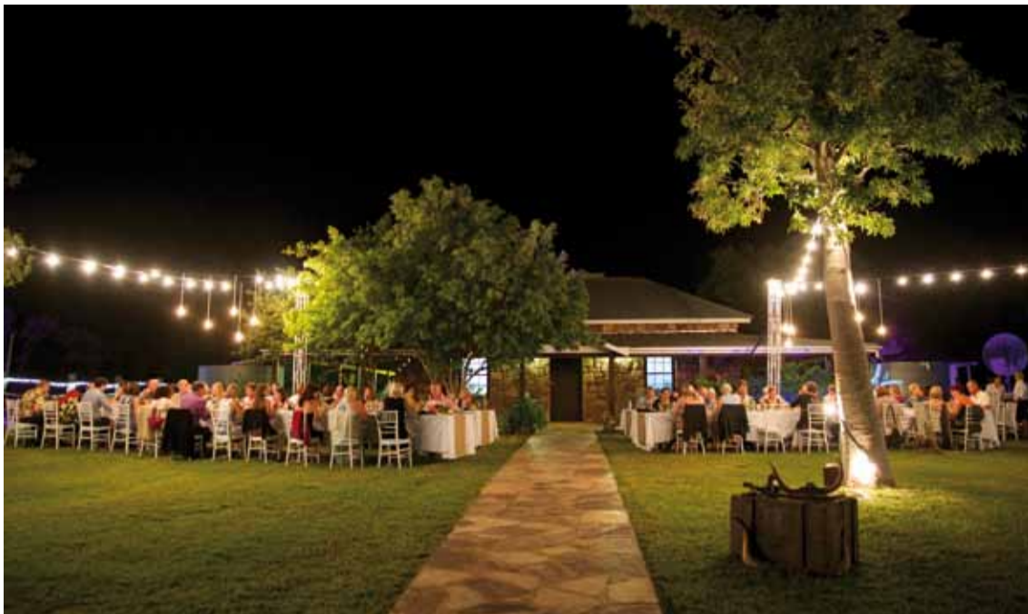
The Durack Homestead holds a dinner during the Muster – tickets by ballot only

PEOPLE who plan to head north in their caravans should book early for the Ord Valley Muster from 13 to 22 May. The breathtaking ancient landscape of the Kimberley with its magical energy deserves to be listed as a star attraction in the Argyle Diamonds Ord Valley Muster, alongside the top Australian culinary, music, and entertainment luminaries who feature in the stellar