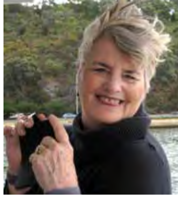
by Fifi Lefebvre

IT'S been 12 months since I boarded a flight at Perth Airport, armed with sufficient cabin baggage to warrant arrest. However the heaviest luggage I was taking with me was that embedded deep in my heart, emotional baggage. For once again I was on the move.