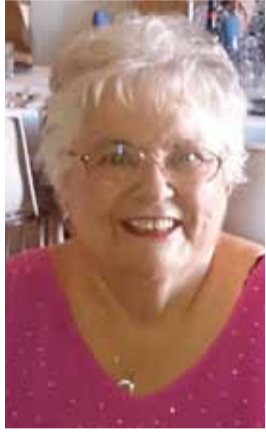
by Anne Osborne

I ARRIVED in Australia from the UK in 1961 as a '10 pound Pom'. It was not an easy transition for me, in fact from the moment I jumped off the SS Orion at Victoria Quay in Fremantle, I hated Australia. I hated the smell of the eucalypt trees, the heat and every-